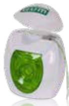
3500 GUM TWISTED FLOSS 984881019