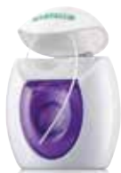
2030M GUM Expanding Floss 900415100