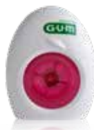
1155 GUM Butlerweave' cerato 906668076