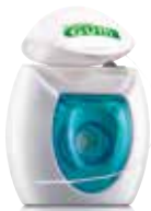
2040 GUM Original White 904802749