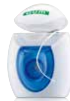
2000 GUM Easy-Floss 935689808