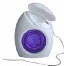
3220M GUM ORTHO Floss 933015238