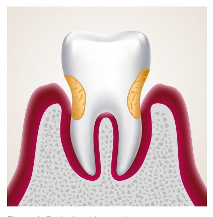
Figure 1. Periodontitis can damage gums, teeth and surrounding tissues

Inflammation is as key cause of periodontal disease and of the development of its worst manifestation (i.e. periodontitits). Periodontal disease occurs when the gums become infected with bacteria, usually caused by a build-up of plaque on the teeth. 7.8 If not removed, bacteria in the plaque can cause gum tissue inflammation, leading to redness, bleeding on brushing, swelling and soreness, as well as bad breath (halitosis).